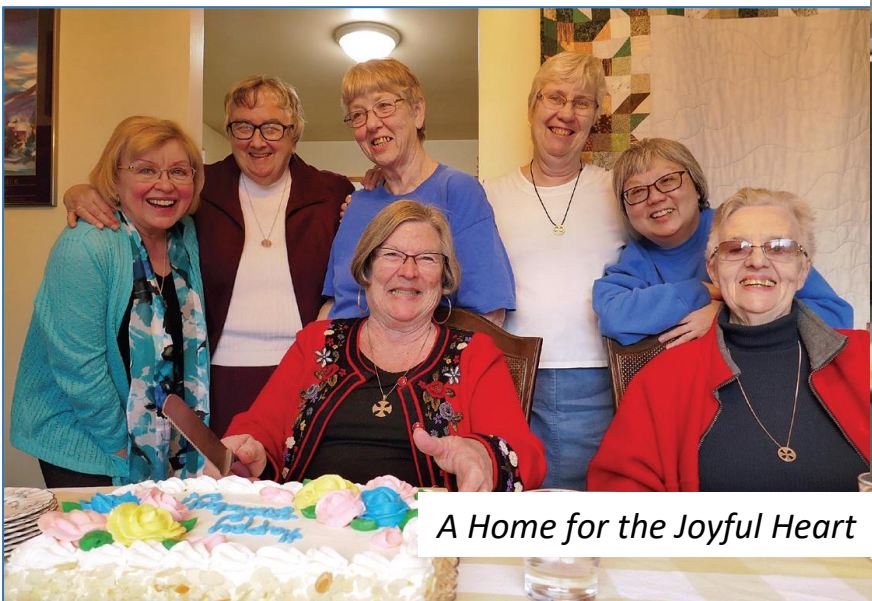
A Home for the Joyful Heart