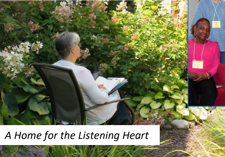
A Home for the Listening Heart