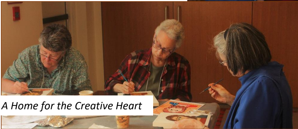
A Home for the Creative Heart