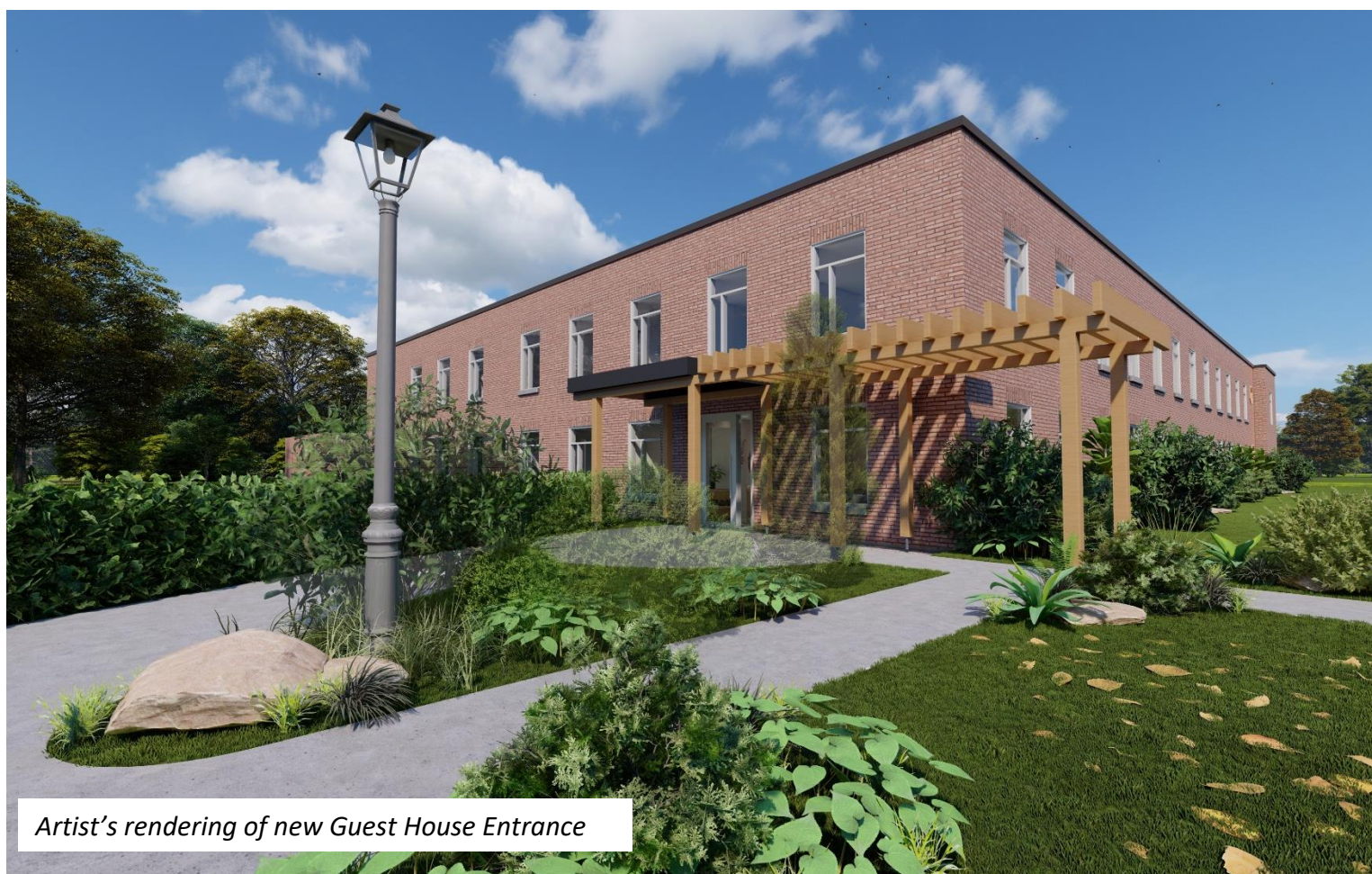
Artist's rendering of new Guest House Entrance

A Case for Support for a Renewed Guest House