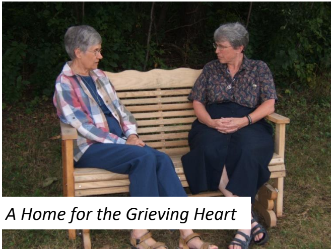
A Home for the Grieving Heart