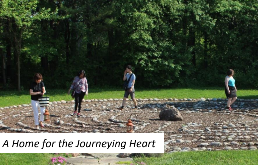
A Home for the Journeying Heart