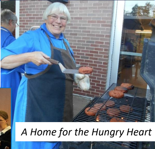
A Home for the Hungry Heart