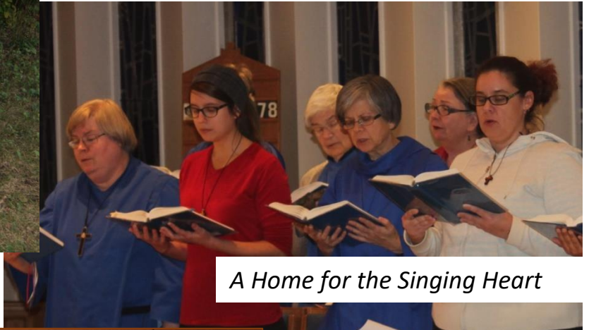
A Home for the Singing Heart