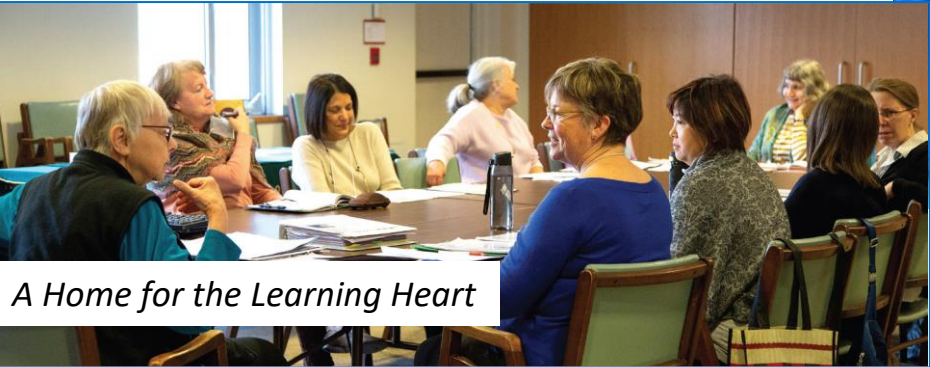
A Home for the Learning Heart