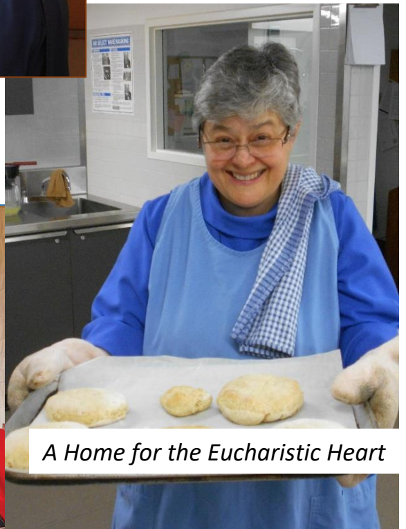
A Home for the Eucharistic Heart