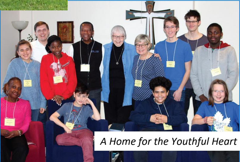
A Home for the Youthful Heart