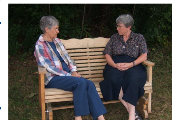
Grieving & Listening