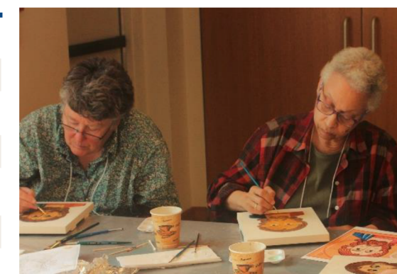
Creative & Joyful