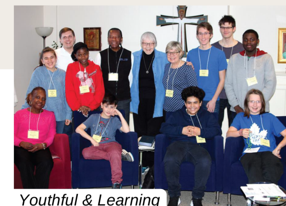
Youthful & Learning