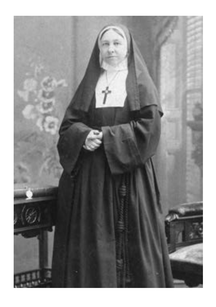
and Day of Prayer for the Guest House Capital Campaign

St. John's Convent, Toronto February 9, 2023